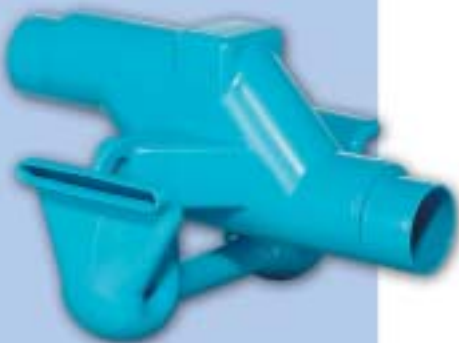
Skimmer removes floating pollutants and prevents rodents from entering tank