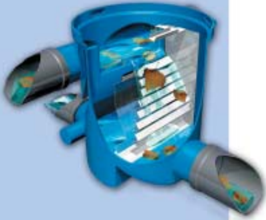
Range of filters available for various capacities and system designs

Once a maximum level is reached in the tank, the siphon constantly skims off the water surface and removes floating pollutants like pollen. The two inlets are slit-shaped to increase the skimmer effect and prevent rodents from entering the tank from the stormwater drain.