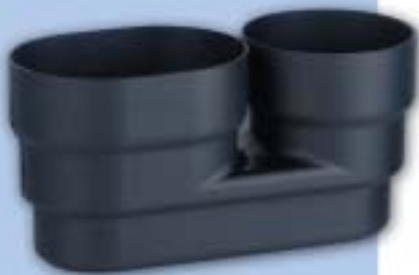
Special inlet design slows the velocity of rainwater entering the tank and prevents it from stirring up sediments